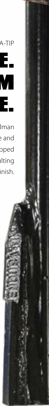
MOHS SCALE OF MINERAL HARDNESS